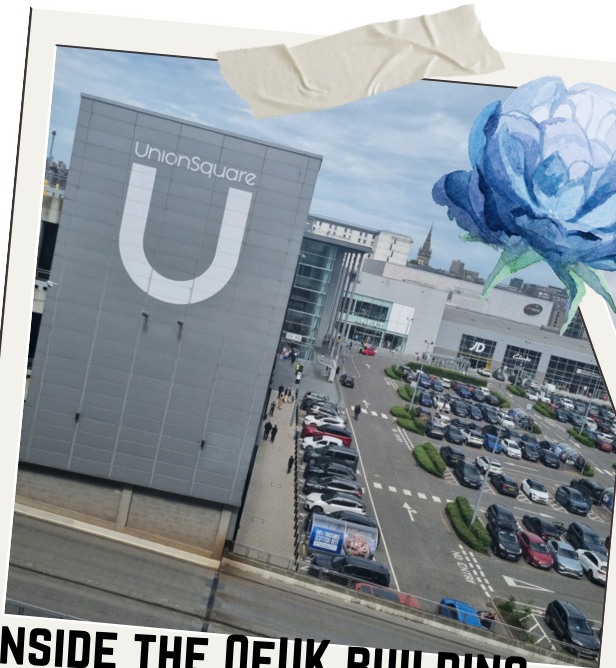
INSIDE THE OEUK BUILDING VIEW

The second week of my internship began with me working comfortably from home, allowing me to start working on the STEM activity advent calendar. I began by designing the front page and then moved on to the information and instructions. The second day, I went to an OEUK visit, and we were given a presentation on what the company does and what Oil and gas businesses do. Then, we moved on to team activities, which included how we'd run our own business and, if we were a government, what kind of policies we'd have as a group. Then the next day I was making a marketing promotion poster showing what could be more attractive to people, and then I continued working on adding the instructions for a couple more STEM activities and adding pictures and details to the Advent Calendar and I also continued to make my Blog and Presentation fixing the writing and adding some pictures.